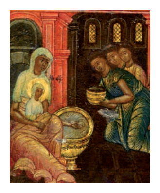
Figure 3 (detail). Water basin shows "reverse perspective" understood as "supplementary planes."

to the laws of normal vision at a single moment of time—but they are frequently, as Florensky notices, emphasized by means of color. These "additional"/"supplementary" surfaces are often painted in strikingly bright colors that capture the attention.